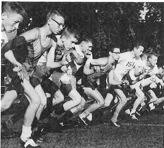
The starter's gun goes off, the line of runners surges forward, and the two to three mile race is on.